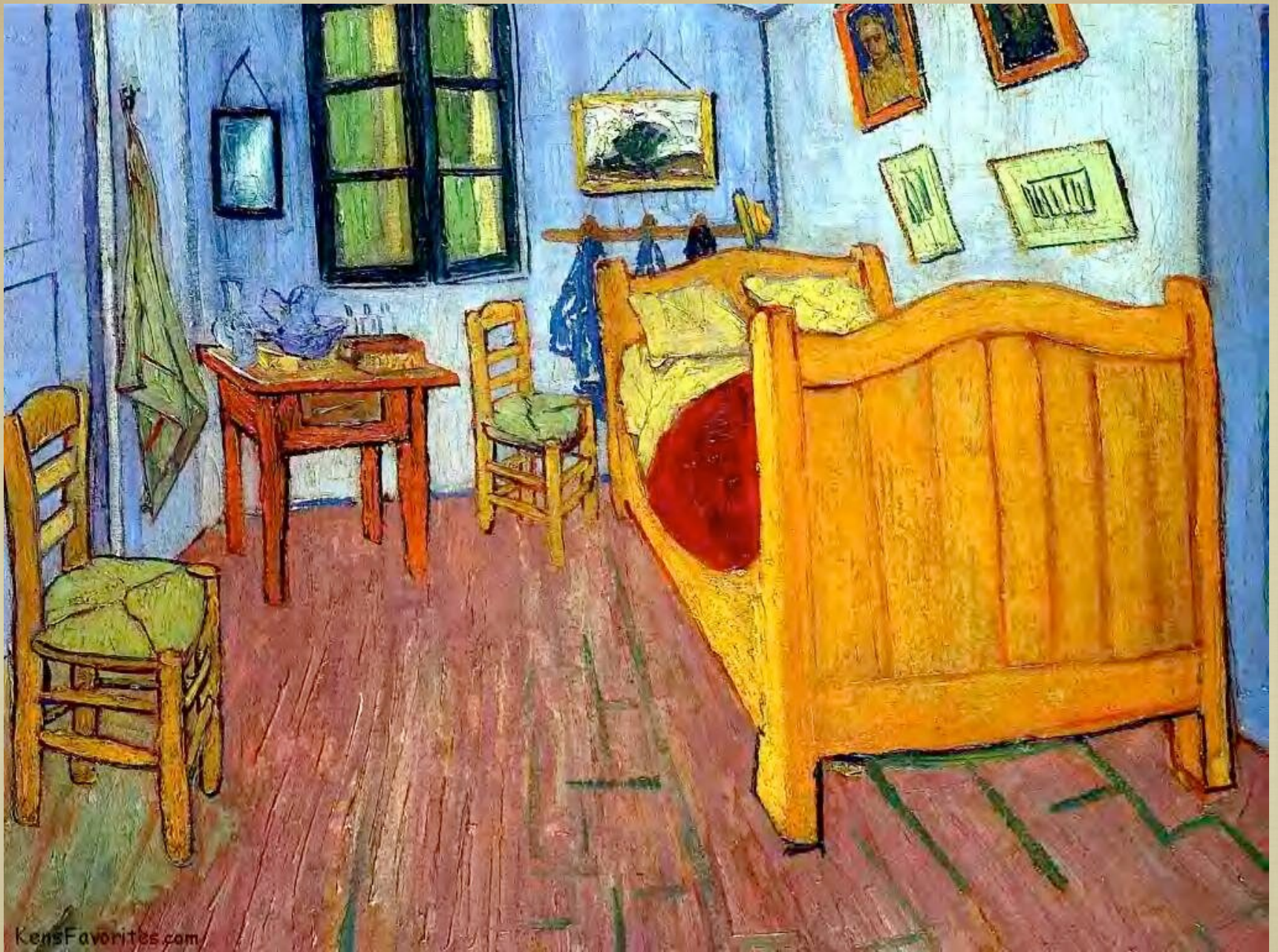
VANGOGH'S BEDROOM, NOTICE THE CHAIR FROM THE PREVIOUS PICTURE?