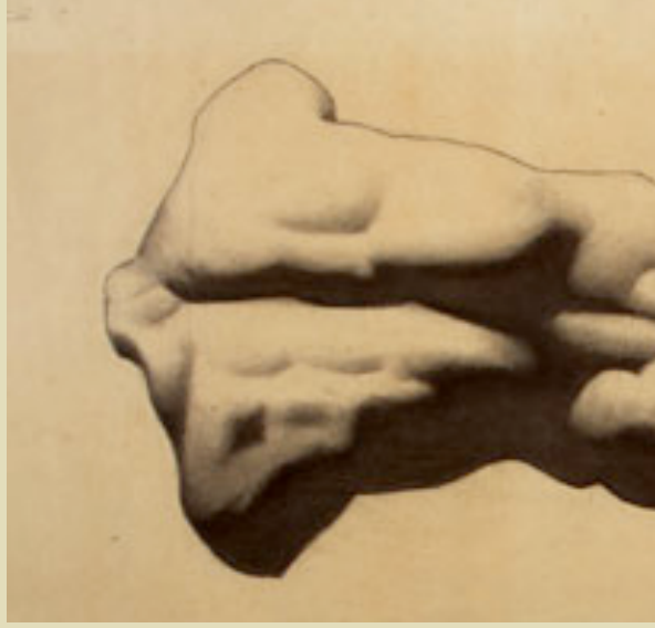
DRAWING OF A BACK AT 12 YEARS OLD!