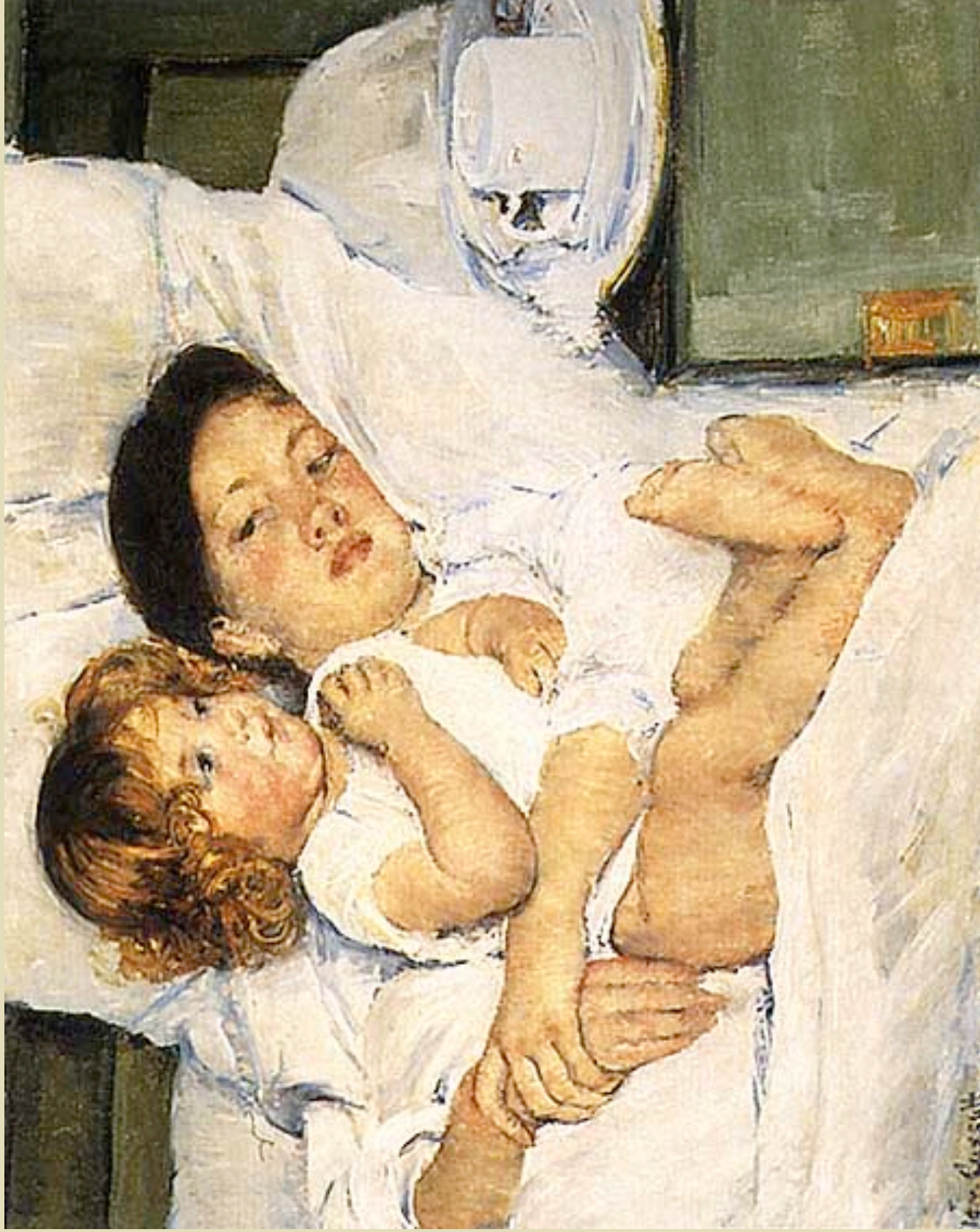
SHE WAS CONSIDERED AN "IMPRESSIONIST" DUE TO HER LOOSE STYLE